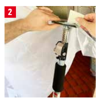
Fix the foil with the help of an adhesive tape on the upper support surface of the drywall support.

Cut the foil to the required size. Note a foil overhang of approx. 10 cm per side.