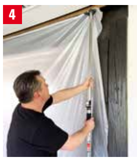
As soon as the drywall support stands vertically between the ceiling and the floor, turn the handle clockwise to fix the support

Now press the release button and pull the telescopic rod out until the support surface and the ceiling touch. Then pull the lower part of the foil under the support surface of drywall support on the floor.