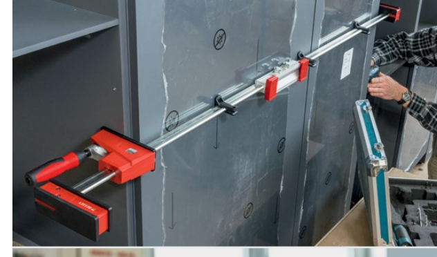
Table clamp TK-6

The TK-6 table clamps provide simple and secure mounting of any KRE, KR, KREV or KRV clamp to table surfaces up to 2 In. thick. They are designed for use with the 8.2 mm holes in the K Body REVO end stops and work piece supports. An excellent tool for use with many bench top power tools, stationary machines as well as holding sacrificial faces to table saw fences. 2 per set.